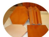
Building materials from industry waste