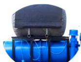
Kitchen waste to biogas unit