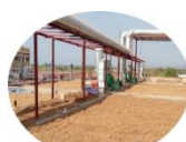
Odour control for industries