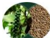
Bioprocess for white pepper