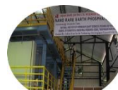
Beach sand & Minerals