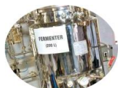
Bioethanol from Agri Residue