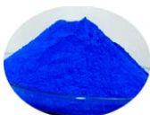
IR reflecting pigment for roofs