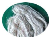
Bioprocess for natural fibres