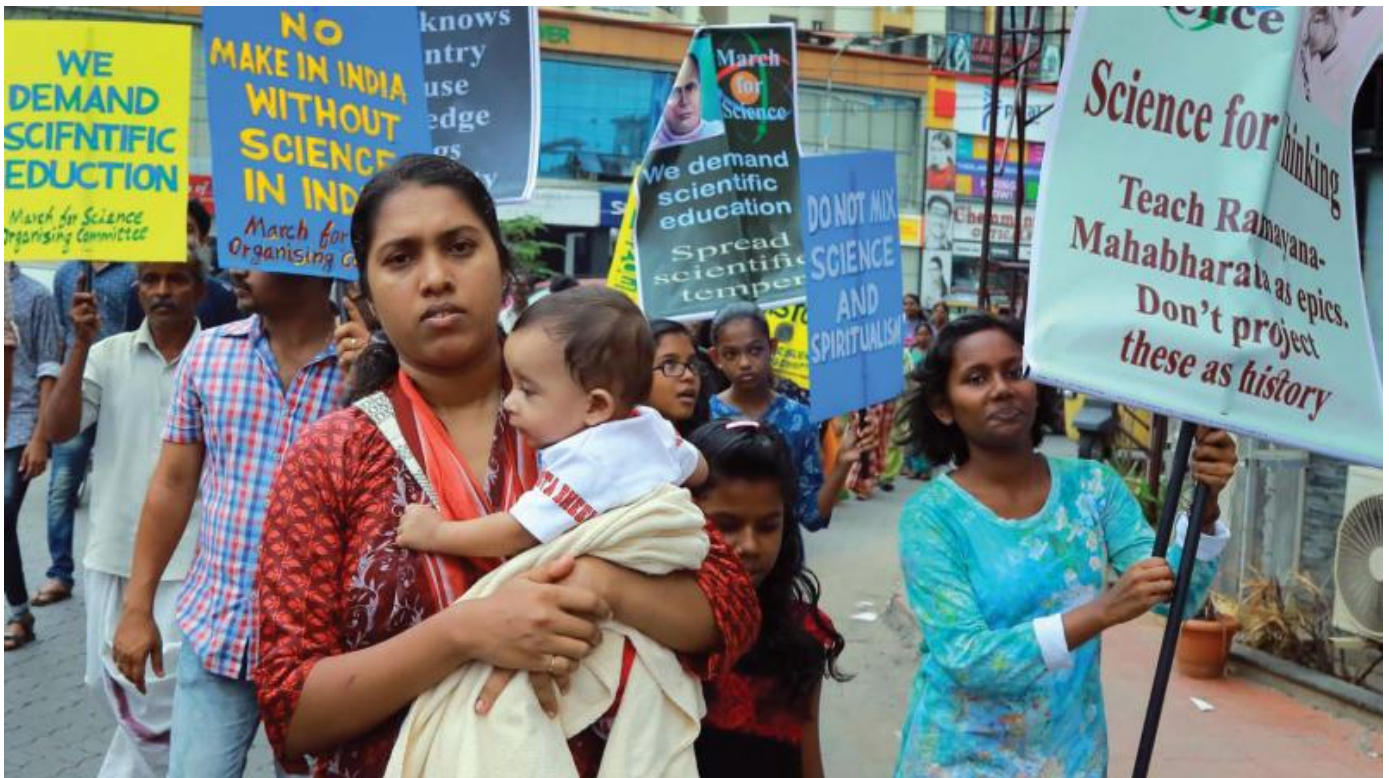
Participants during the 'March For Science' rally in Kochi on Saturday.

Thiruvananthapuram: All over the world, when people for science marched on Saturday, a march was taken out in Thiruvananthapuram as well. Organisers here claimed that the participation from the scientific community has increased. However, many scientists kept out of the event. While the ones working in government institutions said that they would be given memos for participating in a march which demanded more funds for science and education, most pointed out that there were no results to show from the previous event. "Results!" scoffed a scientist who did not wish to be named.