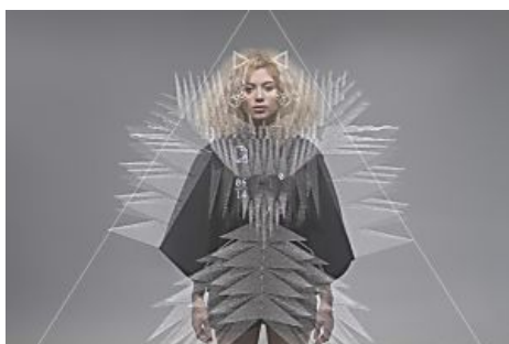
In the Future, This Is How We Will All Virtually Dress [Video] iQ by Intel