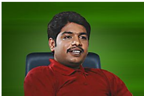
Know how a software engineer surprised his wife! RummyCircle