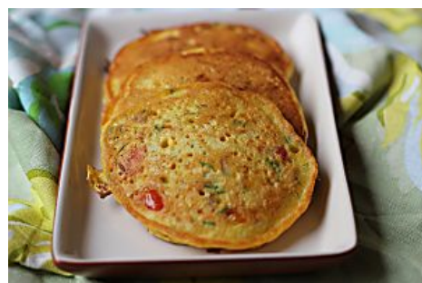
5 healthy breakfast recipes. Saffola Fit Foodie