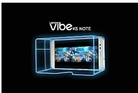
A Killer smartphone that makes everyone take Note. Flipkart