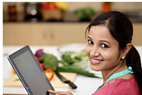
Smart way of investing, start a SIP ABM MyUniverse®