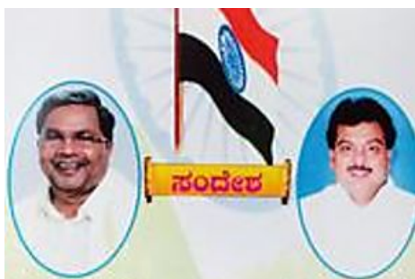
An embarrassing national blunder 16/08/2016