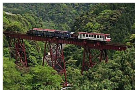
The World's Most Dangerous Railways Feeling Viral