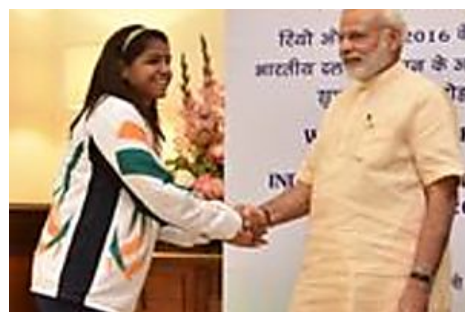
Modi congratulates Sakshi Malik 18/08/2016