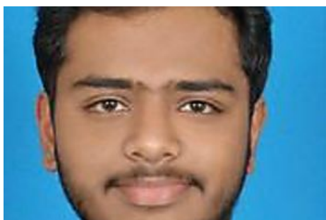
Bengaluru students bag national ranks 17/08/2016