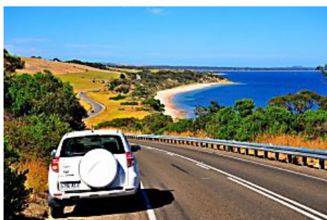
5 Reasons People in India Should Visit Kangaroo Island Wego