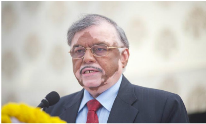
P. Sathasivam, Governor of Kerala.

T he process of selecting the winner of the Chancellor award has started. Soon, the best university in Kerala will be declared. This award is first of its kind in the history of the higher education sector in Kerala. The winner will get an amount of Rs. 5 crores, said P Sathasivam, the Governor. Last year, the award was won by Kerala University. The prize money that the university may win would be utilized for any of the projects that the university wishes to take up.